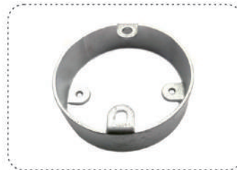
Circular Extension Ring