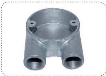
Branch-U Box 2 Ways