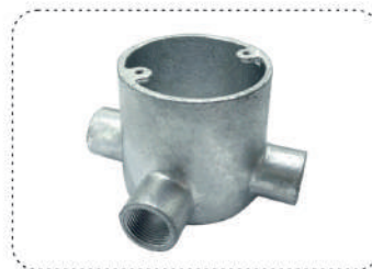
20mm Outlet Deeper Box