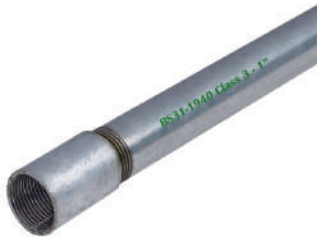
BS31: 1940 (Class 3), IEC 61386-1:2008