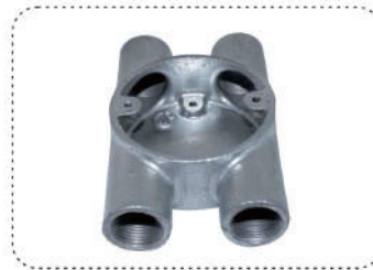
Twin Through-H Box 4 Ways