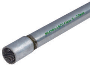
BS4568: PT1 :1970 (Class 3), IEC 61386-1:2008