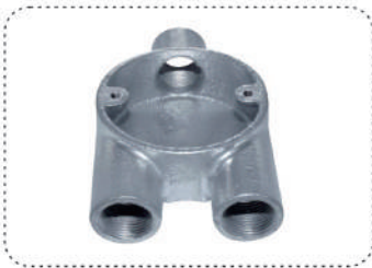
Branch-Y Box 3 Ways