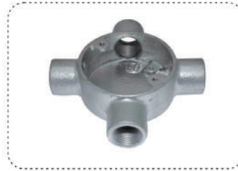
Cross Box 4 Ways