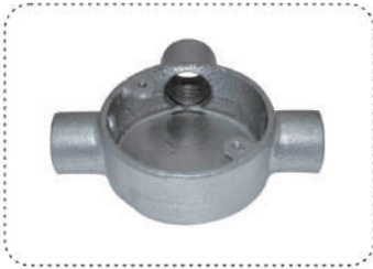
Tee Box 3 Ways