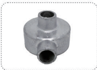
Back Outlet Circular Box