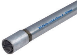
BS4568: PT1 :1970 (Class 4), IEC 61386-1:2008