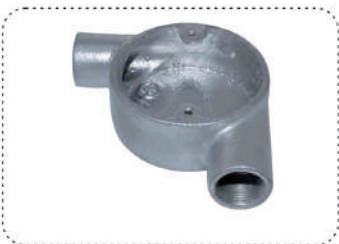
Tangent Angle Box 2 Ways